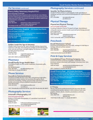
Highlighted Listing Color varies each year!